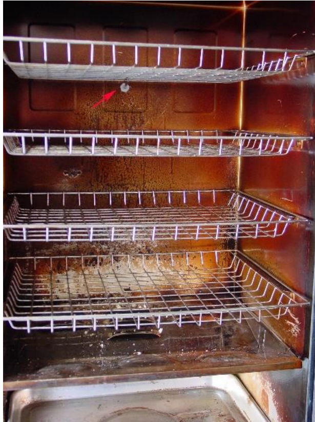
Fig 1, inside view. Red arrow points to the sensor. It should be installed close to the top cooking rack but not touch it. It could interfere with the food on the second rack if it is lower than that position.