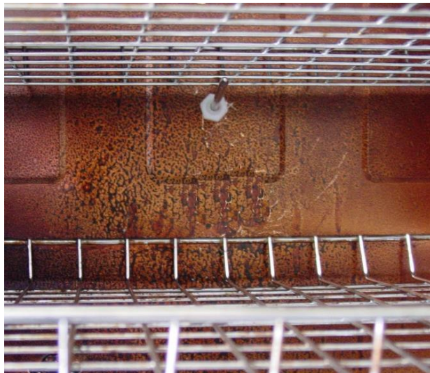
Fig. 2, Close up view